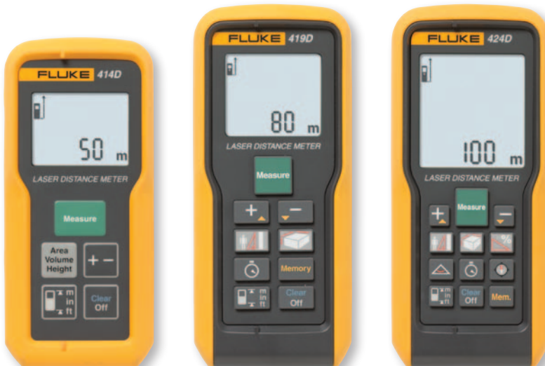
Fluke 414D, 419D and 424D Laser Distance Meters.