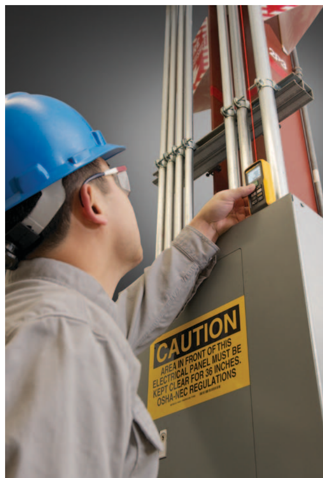
Measuring height to tall ceiling.