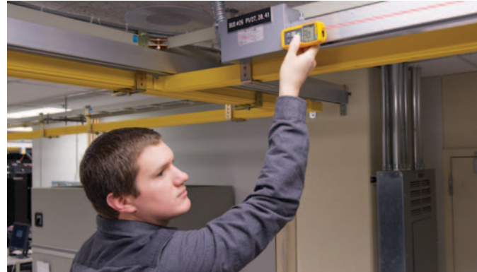
Measuring hard to reach areas.