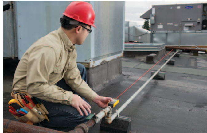
Measuring long distances.