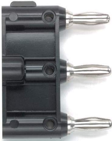
Model 2970 Triple Banana Plug