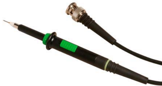
Model 6494 Modular Passive Oscilloscope Probe with Readout Actuator