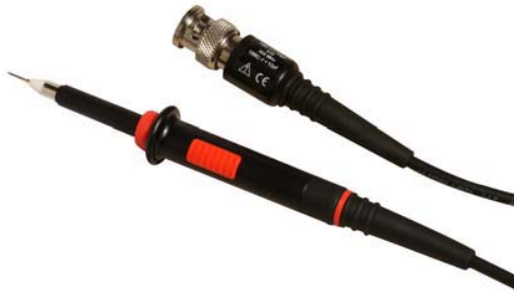
Model 6495 Modular Passive Oscilloscope Probe