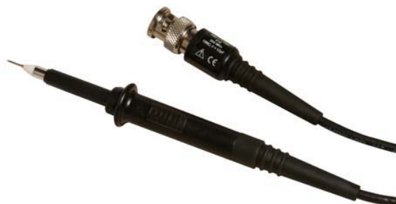
Model 6497 Modular Passive Oscilloscope Probe with Readout Actuator