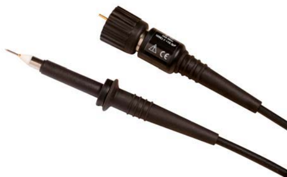
Model 6551 Microline Passive Oscilloscope Probe with Readout Actuator