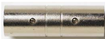
Model 6857 XLR (M/M) Adapter