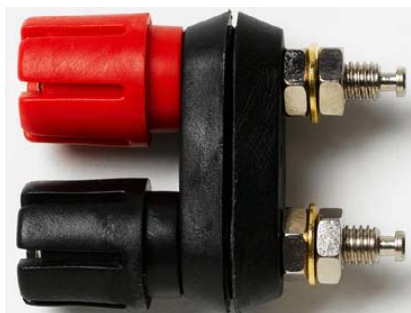
Model 6883 Dual Binding Posts