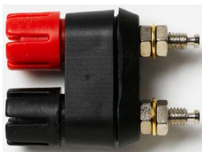
Model 6884 Dual Binding Posts with Raised Base