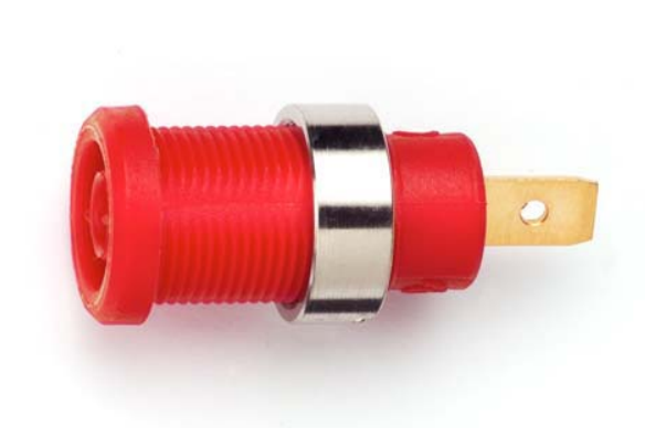
Model 72913 Panel Mount IEC61010 4mm (0.16in) Jack for Sheathed Banana Plugs