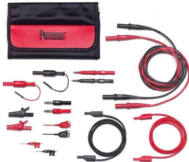
Model 72928 SMD Multi-Use Test Kit