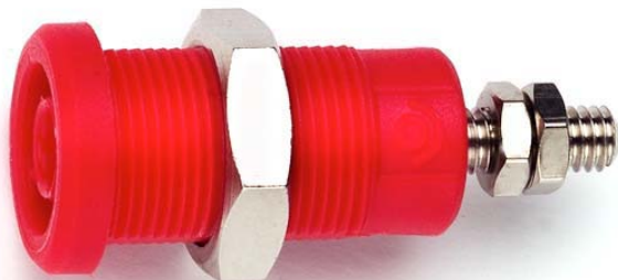
Model 72930 Panel Mount IEC 61010 4mm (0.16in) Jack for Sheathed Plugs