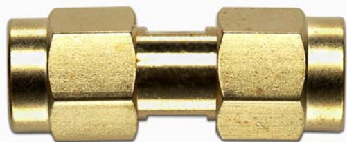
Model 72974 SMA JACK TO REVERSE SMA PLUG

High bandwidth, small size, and durability for confident connections