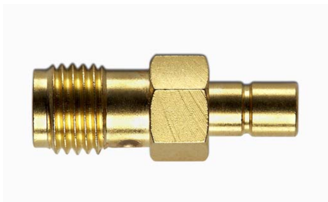
Model 72978 SMA (F) TO SMB (M)