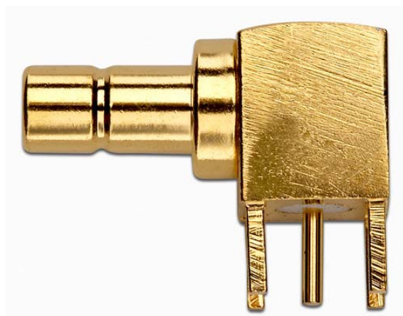
Model 72998 SMB JACK R/A PCB RECEPTACLE