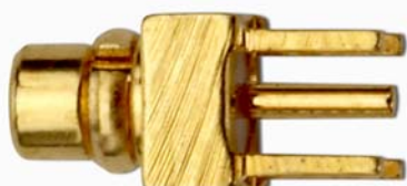
Model 73038 MMCX PLUG STRAIGHT EDGECARD