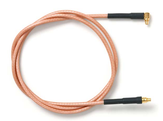
Model 73064 MMCX Plug to Right-Angle MMCX Plug, RG316/U

Snap-on coupling and microminiature size for fast connect and disconnect where space is limited