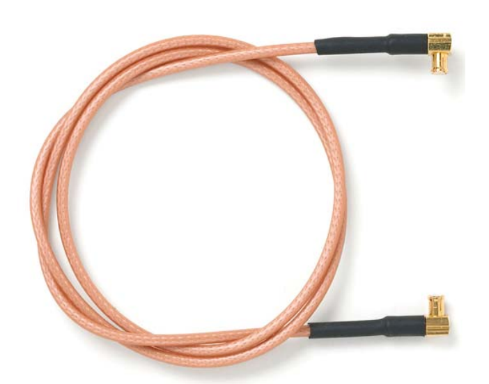
Model 73068 MCX Right-Angle Plug to MCX Right-Angle Plug, RG316/U