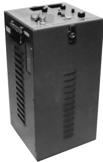
15-kV Portable Model, Cat. No. 651017