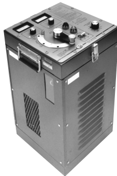
Dual-voltage Model, Cat. No. 651016

This model is designed primarily for direct buried cable in applications that require instrument transport without a truck or van.