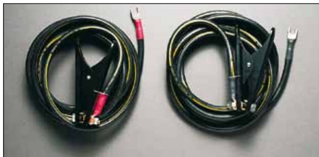
Cable set GA-05052