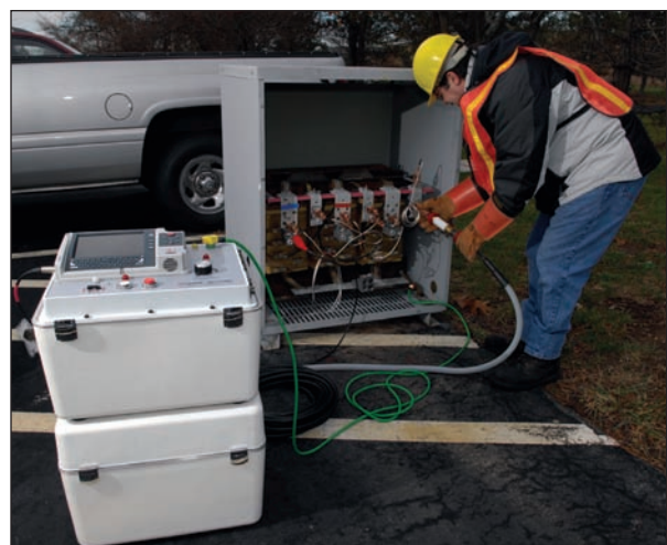
DELTA3100 shown testing a pad mount transformer