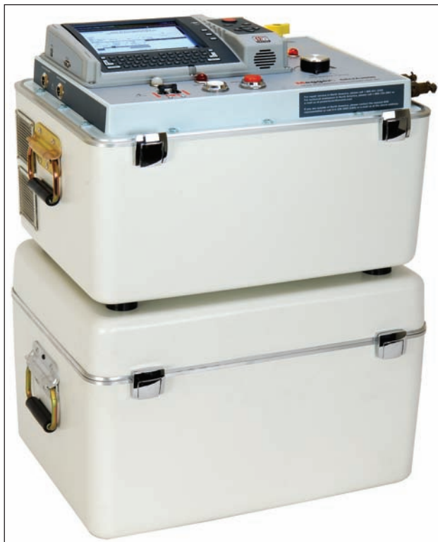
The DELTA3100, available in either 120 or 240 V ac/50 or 60 Hz, includes the control unit (top) and auxiliary module (bottom) containing HV amplifier and LV three-phase TTR circuitry.