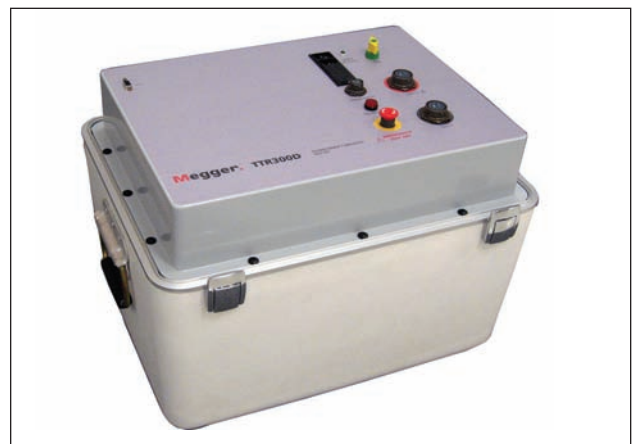
LV three-phase TTR test connections shown, integrated inside DELTA auxiliary cabinet. (Lid not shown for clarity.)

quantities include voltage, current, power (loss), power factor and capacitance. The operator has the option of correcting the current and loss readings to their 2.5 kV or 10 kV equivalents. Information can be downloaded directly to a PC or USB flash device, allowing the user to store up to 100,000 data sets. Printing is done via a second USB port directly to a USB thermal paper printer (included) allowing the user to print full-size test forms in either 8.5" x 11" or A4 size, without the use of an external laptop.