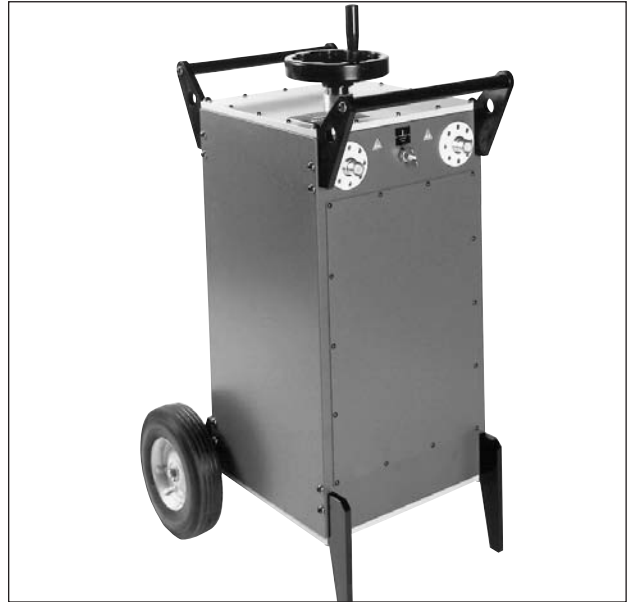
The optional Resonating Inductor expands the capacitance range of the DELTA3100