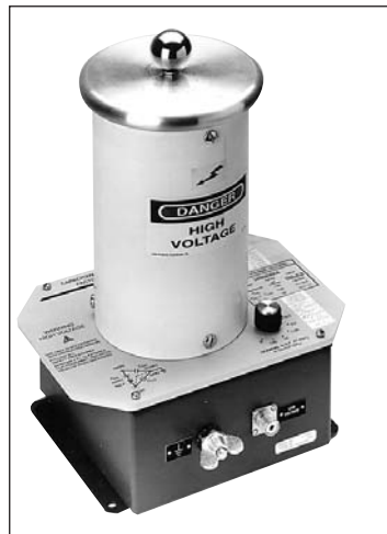
The optional Calibration Standard traceable to the NIST for quick operating or calibration checks of test set bridges calibrated in watts loss or in dissipation factor