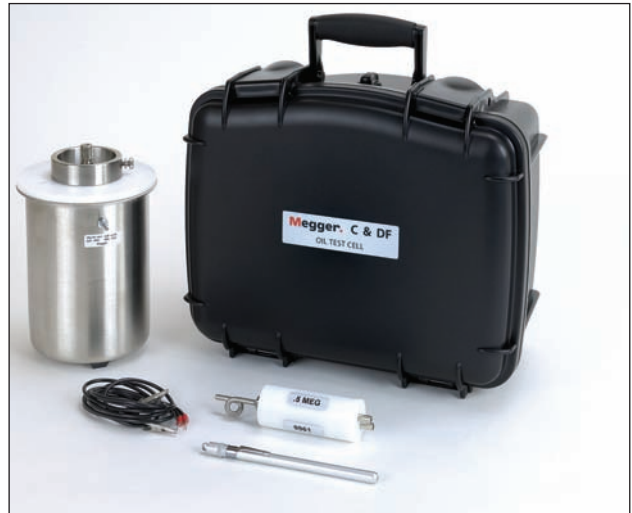
The optional Oil Test Cell, C/N 670511, is used for testing insulating fluids up to 10 kV