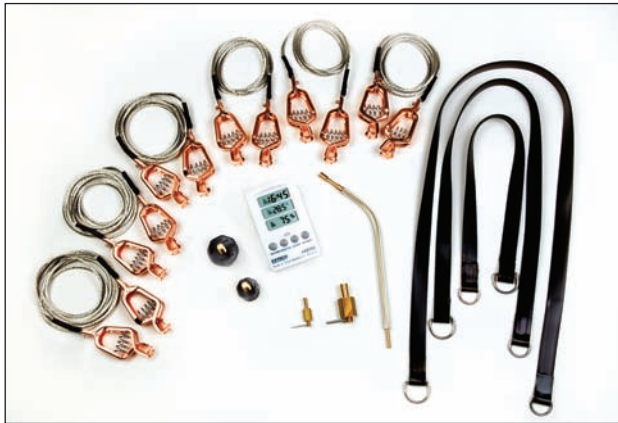
The optional accessory kit, C/N 670501 includes mini bushing tap connectors, hot collar straps, temperature/humidity meter, .75" bushing tap connector, 1" bushing tap connector, "J" probe bushing tap connector, 3-ft non-insulating shorting leads, 6-ft non-insulating shorting leads