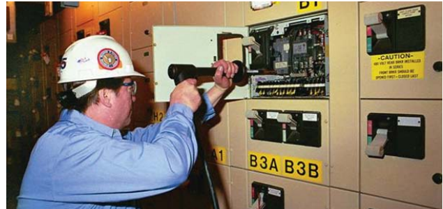
MCCB testing using the HCP2000