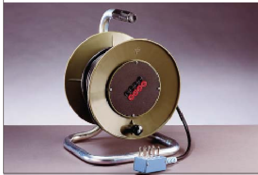
Cable reel, BL-90060