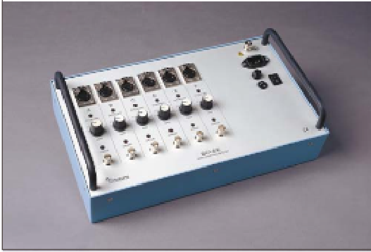
Signal conditioning amplifier, SCA606