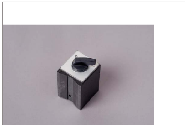
Switch magnetic base