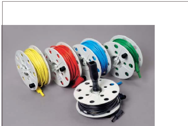
Cable reels, 20 m (65.5 ft), 4 mm stack-able safety plugs