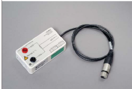
Voltage divider, VD401