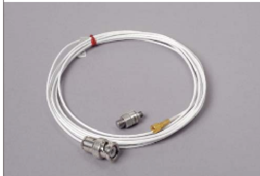
Accelerometer, Dytran 3200B5 and cable