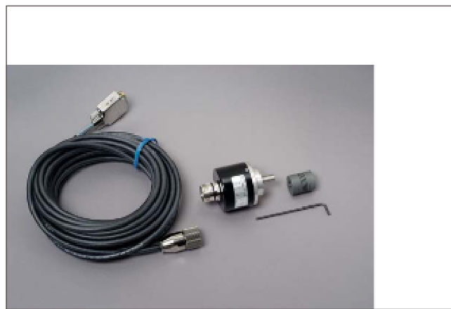
Rotary transducer, Baumer BDH (digital)