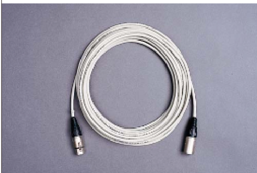
Extension cable XL, GA-00150