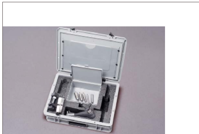
Rotary transducer mounting kit