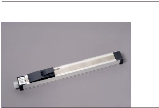
Linear transducer, TLH 225