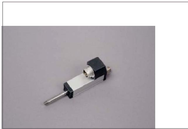
Linear transducer, TS 25