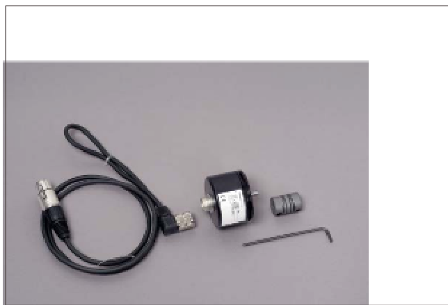
Rotary transducer, Novotechnic IP6501 (analog)