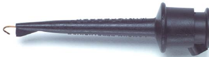
Model 4555 Do-It-Yourself Minigrabber Test Clip