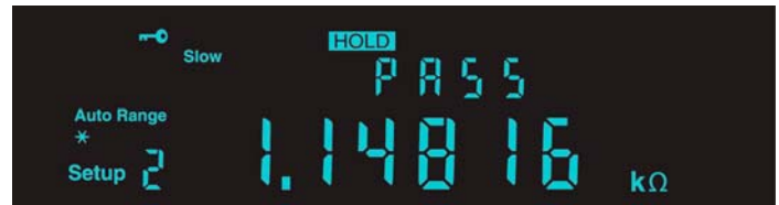
Limit compare mode on the DMM4020.

Dedicated front-panel buttons provide fast access to frequently used functions and parameters, reducing setup time. You no longer need to search through software menus to find the function you need.