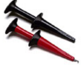
AC280-FL: Hook Clips.