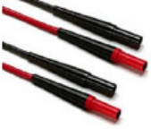
196-3523-00: Extender Leads (1.5 m).