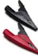
AC285-FL: Alligator Clips.