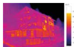
Thermal image with ScaleAssist