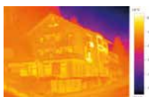
Thermal image without ScaleAssist

Since the temperature scale and colouring of thermal images can be adapted individually, it is possible that the thermal behaviour of a building, for example, can be wrongly interpreted. The testo ScaleAssist function solves this problem by adjusting the colour distribution of the scale to the interior and exterior temperature of the measurement object and the difference between them. This ensures objectively comparable and error-free thermal images.