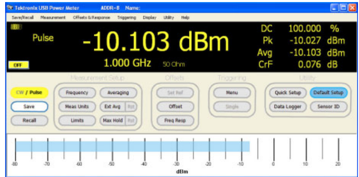
Figure 1 – Software presents familiar controls and measurement presentation.

Tektronix PSM Series power sensors feature the industry's fastest measurement speed (2000 readings/s). This can significantly reduce