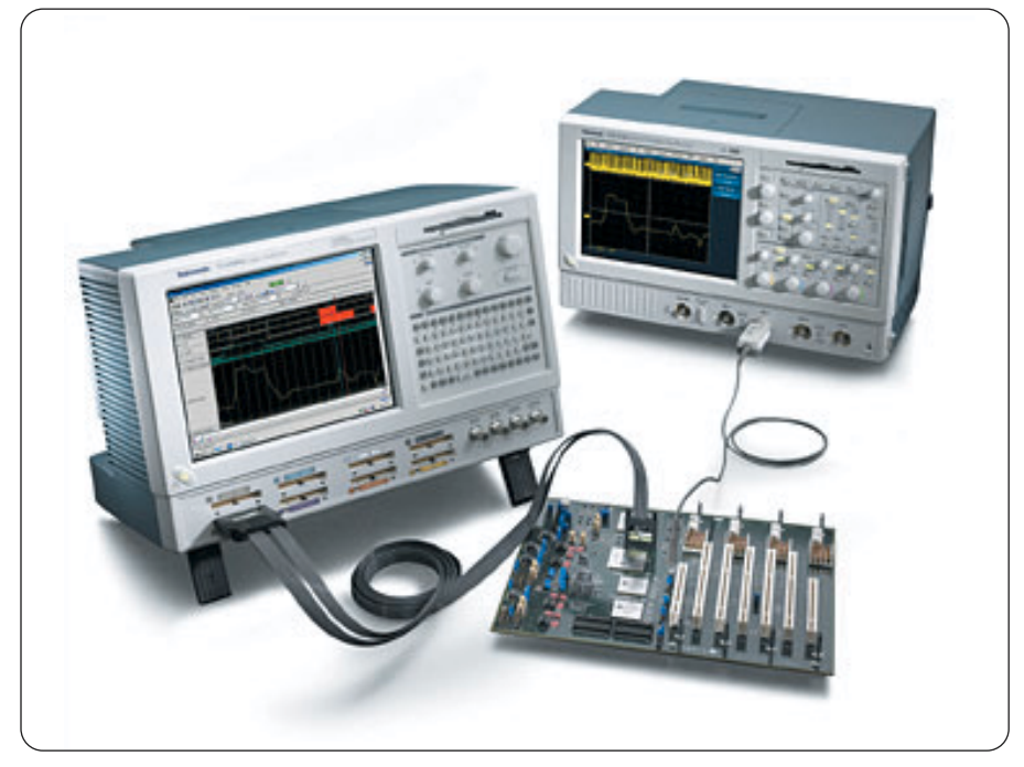
TLA5000 Series with TDS5000 Series Oscilloscope.

TDS oscilloscope configuration requirements -The iView™ cable does not connect fully to the TDS1000/2000 Series oscilloscopes without a GPIB extender. Tektronix recommends a standard GPIB cable as an extender, or order a cable extender (National Instruments part number 181638-1). TDS2CMAX Communications Extension Module required for iView capability on any TDS1000/2000 Series. TDS3GM GPIB/RS232 Interface Module required for iView capability on any TDS3000 Series. TDS3GV GPIB/RS232/VGA Interface Module required for iView capability on any TDS3000B Series. If using TLA7Axx iConnect with a TDS6404, TDS6604, TDS7154, TDS7404, or CSA7154 oscilloscope, four TCA-BNC connectors are required to be compatible with BNC cable from the TLA7Axx module.