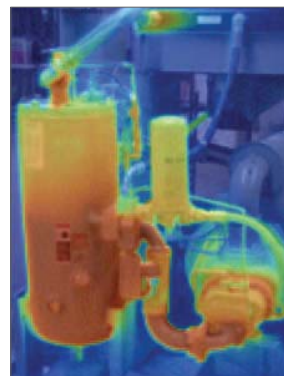
AutoBlend™ mode: Only Fluke has mastered the ability to blend partially-transparent infrared and digital images for easier problem detection.

Infrared images alone can be difficult to understand, which is why Fluke pioneered IR-Fusion® technology. Fluke IR-Fusion technology is the industry's only pixel by pixel alignment of digital and infrared images, providing the highest level of clarity and accuracy in the industry. Others have tried to copy, but no one has matched this powerful feature. Turn to Fluke patented IR-Fusion technology to deliver the industry's best infrared images.