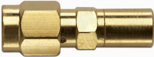
Model 72977 SMA (M) TO SMB (F)

High bandwidth, small size, and durability for confident connections.