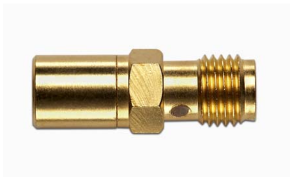
Model 72979 SMA (F) TO SMB (F)