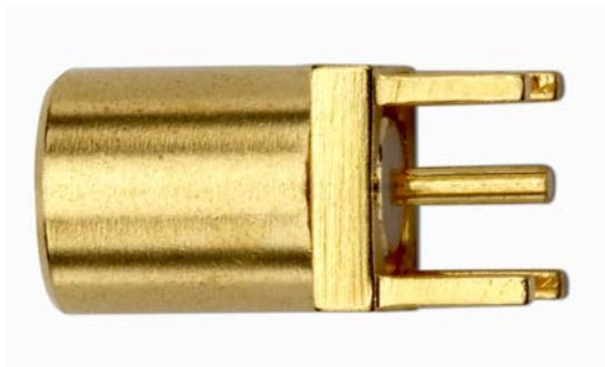
Model 72995 SMB PLUG STRAIGHT PCB RECEPTACLE