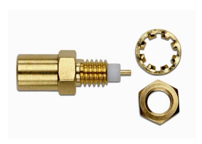
Model 72999 SMB PLUG PANEL RECEPTACLE