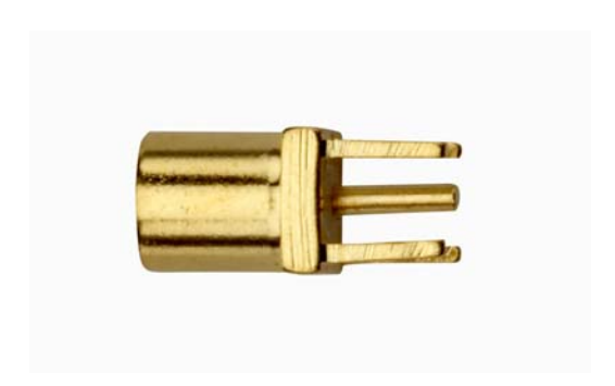
Model 73039 MMCX JACK STRAIGHT EDGECARD