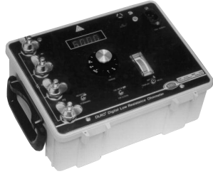
The Low-Range DLRO, Cat. No. 247002, features an extra range and rugged, Single-Pak design.