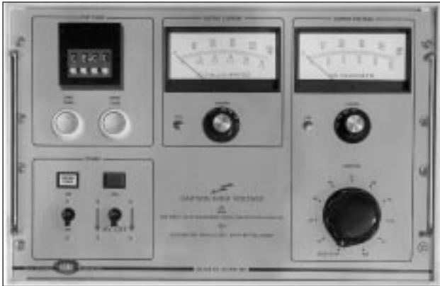
Typical control panel of the standard 50/100 kV ac test set showing test timer option at top, left